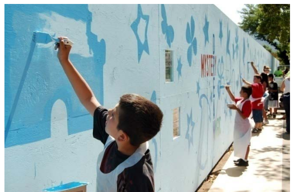
Local youth put finishing touches on the construction wall mural

http://www.cityofgilroy.org/cityofgilroy/city_hall/community_development/engineering/projects/default.aspx